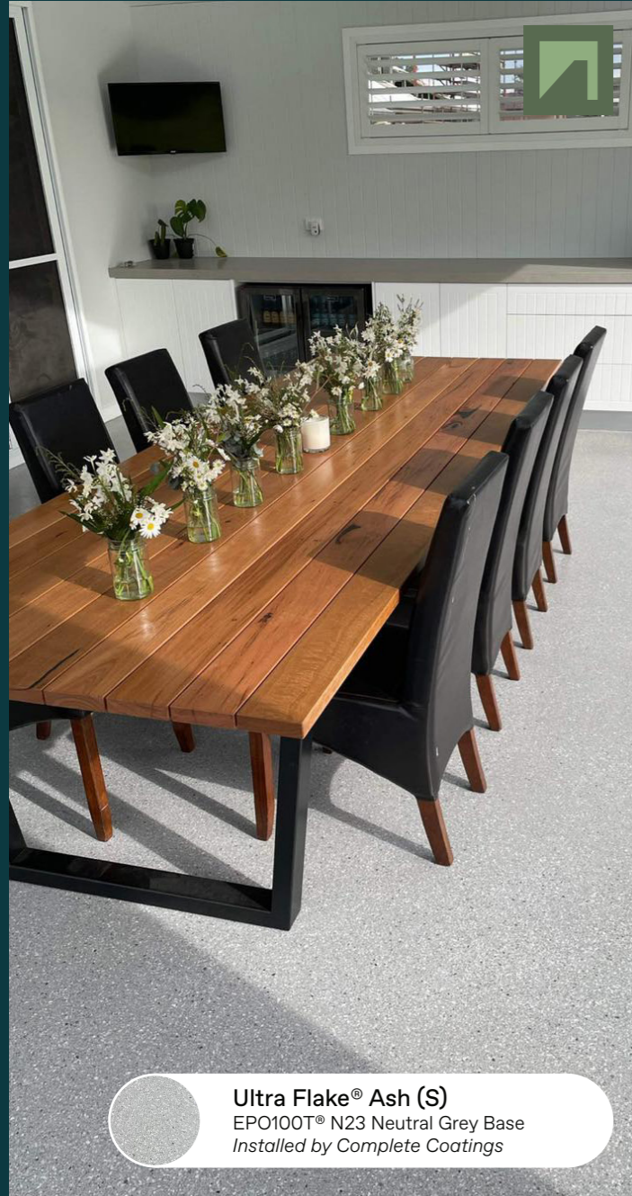
Ultra Flake® Ash (S) EPO100T® N23 Neutral Grey Base Installed by Complete Coatings

Due to its range of colour options, Ultra Flake® systems have become a desirable and competitive modern flooring alternative to carpet and tiles.