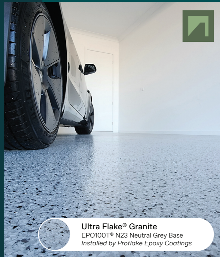
Ultra Flake® Granite EPO100T® N23 Neutral Grey Base Installed by Proflake Epoxy Coatings